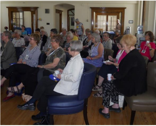
1969 Class in the parlour