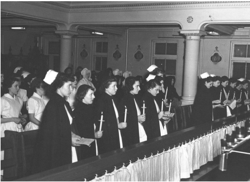
Capping Ceremony in the chapel