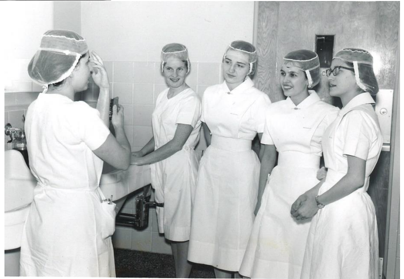
Learning to scrub in L & D