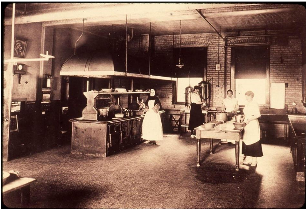
Hospital Kitchen 1905