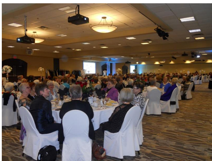
Annual General Meeting, May 15, 2019 228 were in attendance.