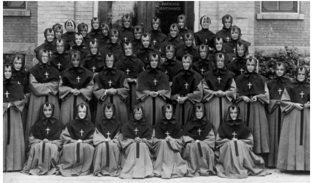
Hospital Administrators and Educators at the School of Nursing