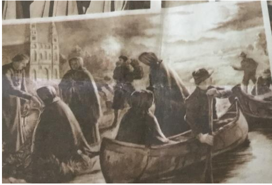
Arrival June 21, 1844

A celebration of 175 years since their arrival to St. Boniface on June 21, 1844. A wonderful celebration was held on June 21, 2019 to commemorate their compassion, caring and extra ordinary courage to help those in need! Congratulations and many thanks to all the Grey Nuns that have contributed so much over the years to our education and health care system!